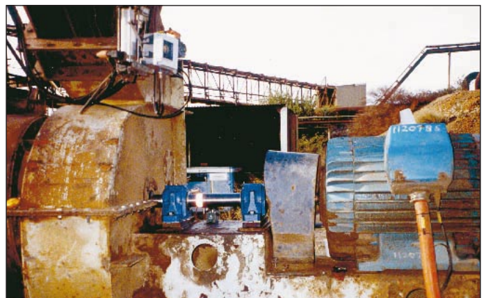
View of the fan