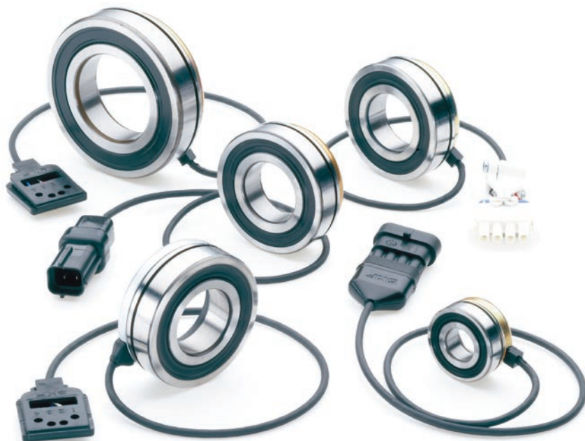
SKF motor encoder units – sizes from 6202 to 6209